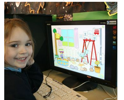
Recognising and remembering environmental sounds Kew Woods Primary, Stockport