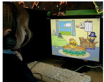
Letters and Sounds – nonsense words Kew Woods Primary, Stockport