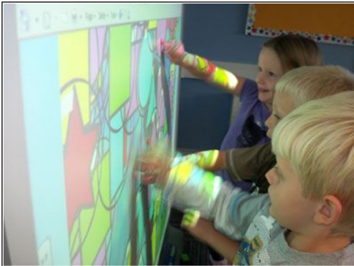
At the whiteboard