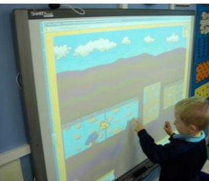
Complete the tunnel by rotating shapes Kew Woods Primary, Stockport