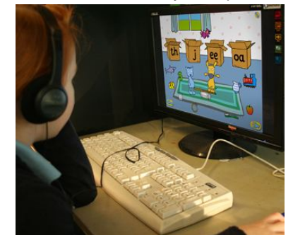
Graphemes and phonemes – sound sorting Kew Woods Primary, Stockport