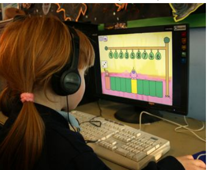
Recognising numerals Kew Woods Primary, Stockport