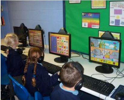
Computer suite Kew Woods Primary, Stockport

Kew Woods is a medium sized primary school in Southport Mersyside. Here are pictures of the children using Busythings in nursery, reception and KS1 children.