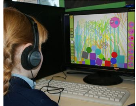
Creating art for the busythings gallery Kew Woods Primary, Stockport