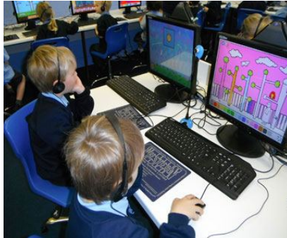
Computer suite Kew Woods Primary, Stockport