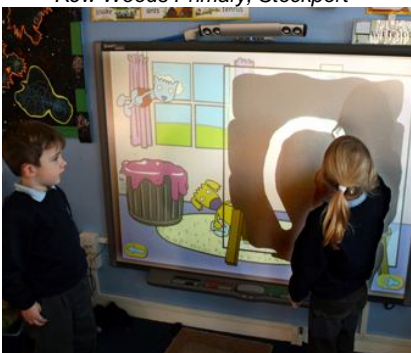
Mark making – letter practice Kew Woods Primary, Stockport