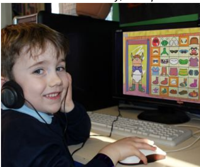
Dressing the baby Kew Woods Primary, Stockport