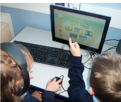
Choosing an activity Kew Woods Primary, Stockport